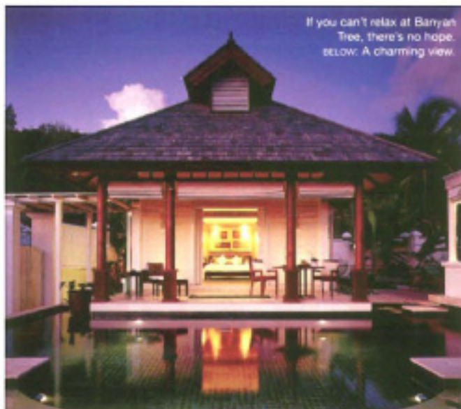
If you can't relax at Banyan Tree, there's no hope. Below: A charming view.